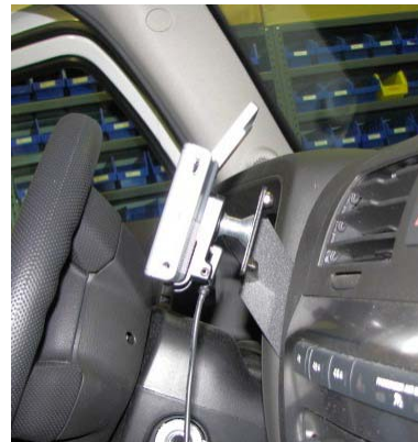
NUVI Installed on Hummer H3 InDash Mount