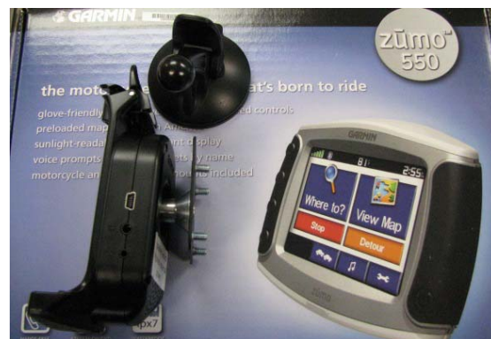
ZUMO Adapter showing Window Mount Ball