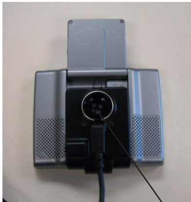
NUVI Mounting Socket

INSTALLATION IS NOW COMPLETE. ENJOY YOUR NEW INDASH by PANAVISE ADAPTER.