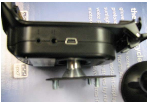
Adapter Installed on ZUMO