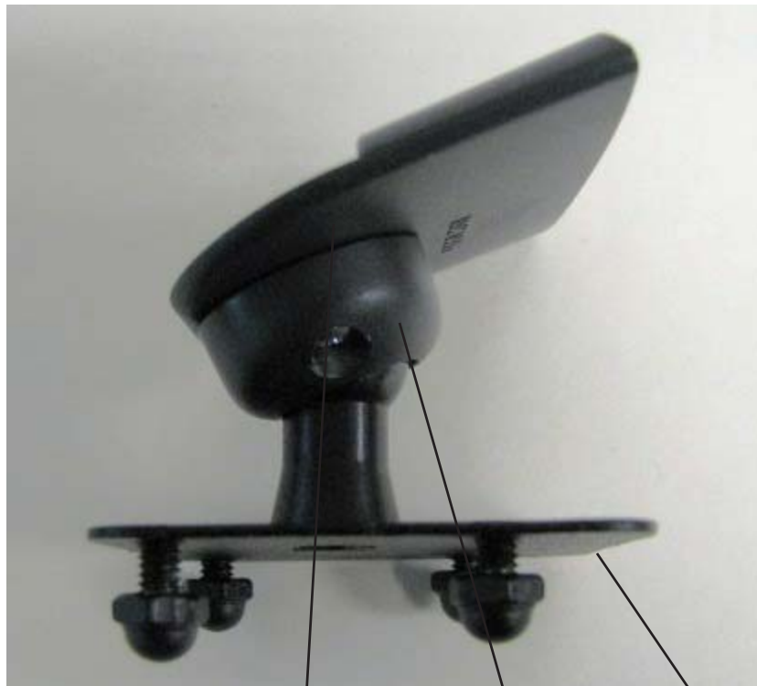
TomTom Mounting Base installed with Cover onto 767-TT2

INSTALLATION IS NOW COMPLETE. ENJOY YOUR NEW INDASH by PANAVISE MOUNT.